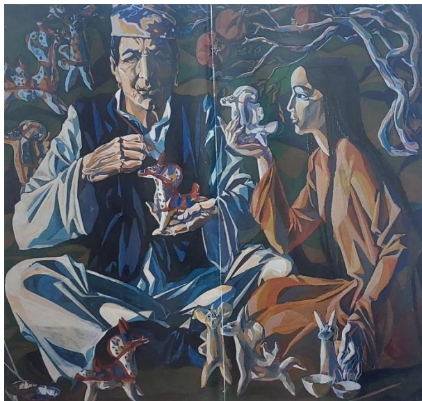
Birth of Fairy Tale,1979