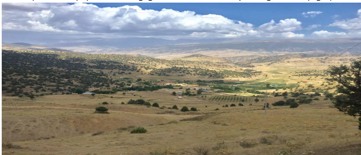
Figure 2. Kyziltom village, Qamashi district.

Qamashi district - one part of the district is attached to the Karshi desert, and another part to the Hisar ridges. There are settlements such as Kaltaqol (74 km), Vori (78), Zarmas (70 km) far from the district center. To get to these settlements, it is necessary to climb many roads, the road (transport) infrastructure does not meet the demand. It would not be wrong to say that there is almost no service to the population here, except for a school and a small village doctor's office. The main part of the population is engaged in animal husbandry and agriculture (Fig. 2).